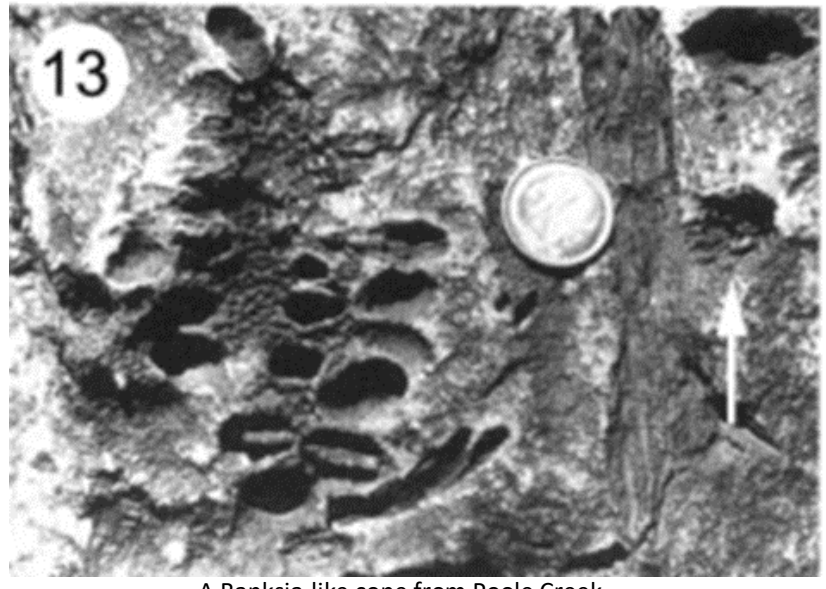
A Banksia-like cone from Poole Creek (Greenwood 2001)